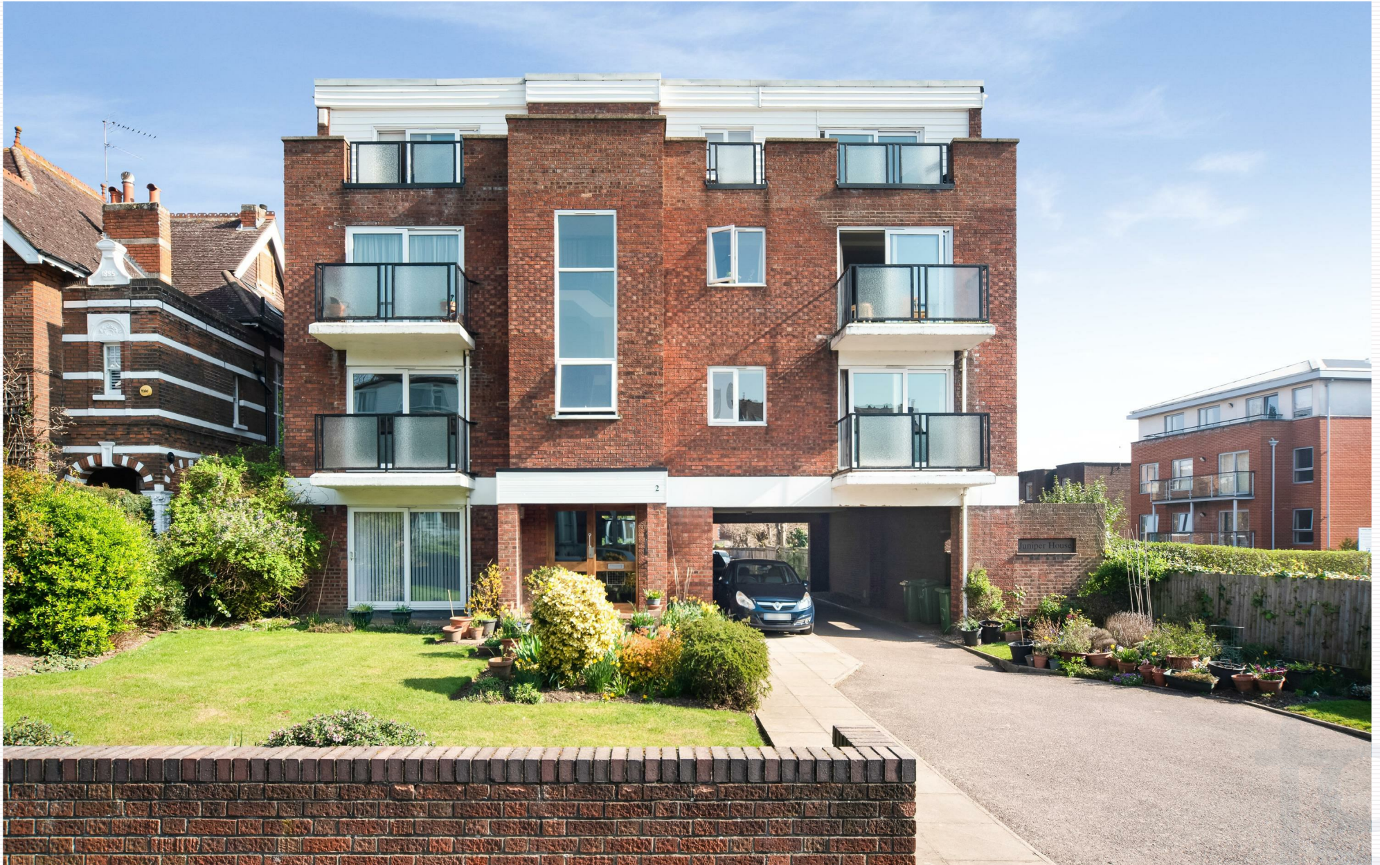
Edge Hill, Wimbledon, SW19 4LP